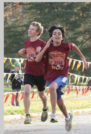
Kids Marathon & 1 Mile Run