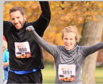
Put Your Hands Up!.