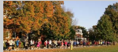
The Beautiful Fall Course