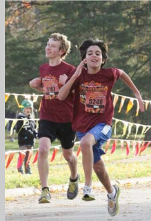
Kids Marathon & 1 Mile Run