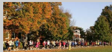
The Beautiful Fall Course